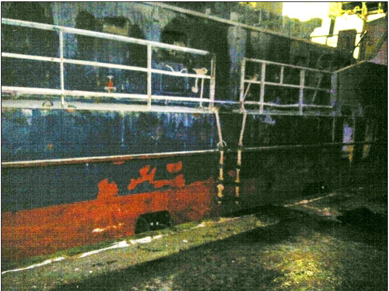
Figure 3: The pilot ladder rigged at the ship's side

The picture below shows how the pilot ladder was rigged. The picture does not show the position of the ladder at the time of the accident as it had been moved before the picture was taken.