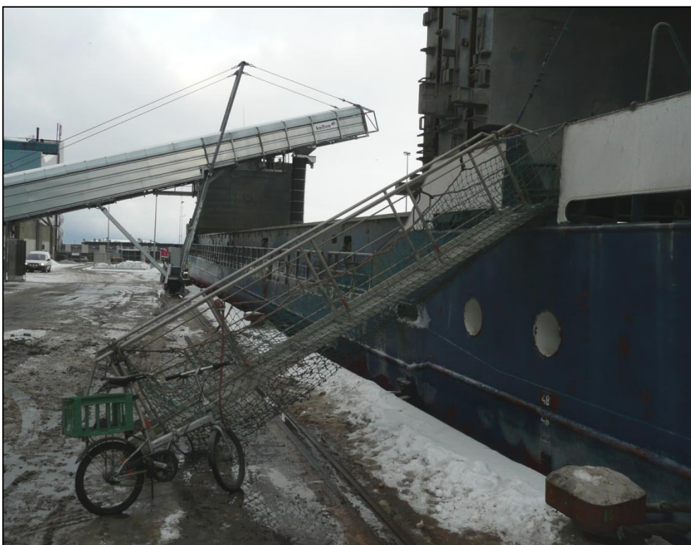
Figure 2: The gangway

During loading and discharging it is often necessary to move the ship in a longitudinal direction. In such cases, it is inexpedient to have the gangway rigged. Another circumstance that makes the use of the gangway difficult is the change of draught when loading and discharging.