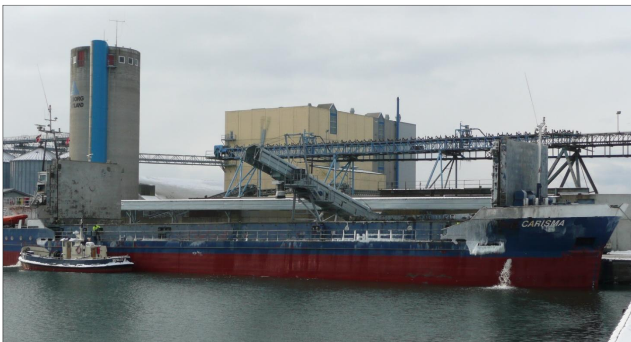
Figure 1: CARISMA in Roenne Harbour