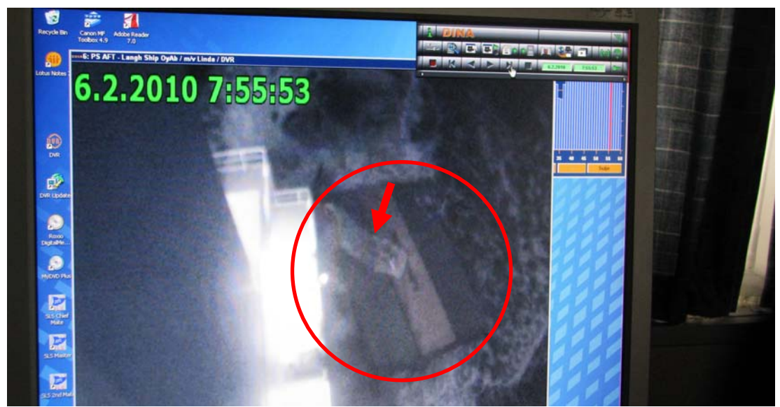
Figure 6. A picture recorded by the vessel's CCTV camera photographed by a camera from a display on the vessel. The block formed by the three containers attached to each other can be seen in the picture (the red circle). The roof of the broken reefer container is on this block (the red arrow). The wall of the reefer container drifts somewhat behind the block.

The vessel has CCTV cameras on the boat deck on both sides of the accommodation spaces. The port side camera recorded the containers in the sea after they had fallen overboard. The containers which contained cargo were attached to each other as one block. For example the roof of the broken reefer was also attached to this block.