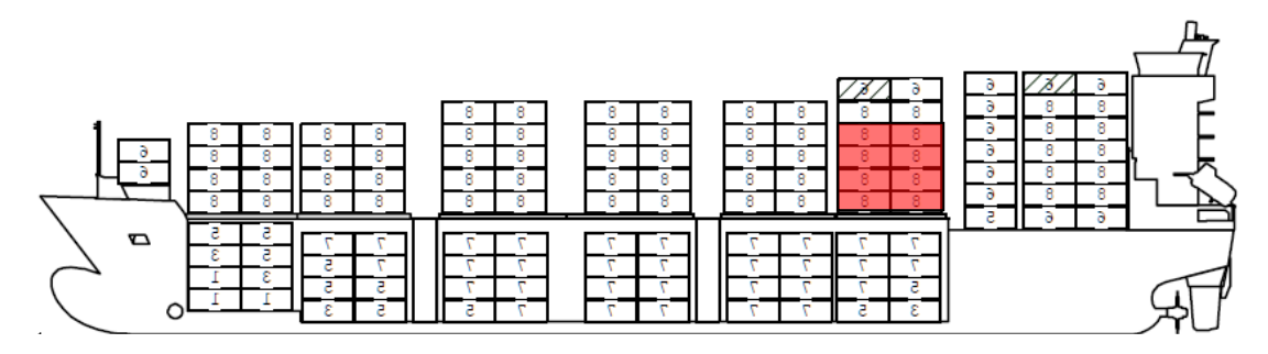
Figure 2. A layout drawing of the cargo spaces on M/S LINDA. The red rectangle indicates the location of the fallen container stack on the outermost bay on the port side of the vessel.