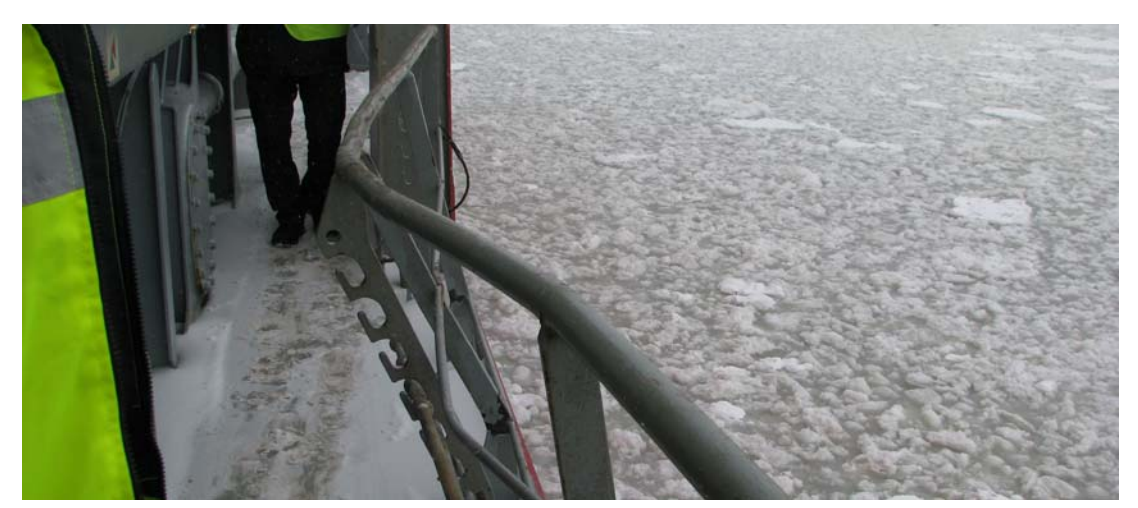
Figure 5. The railing damaged by the fallen container stack on the port side of the vessel.