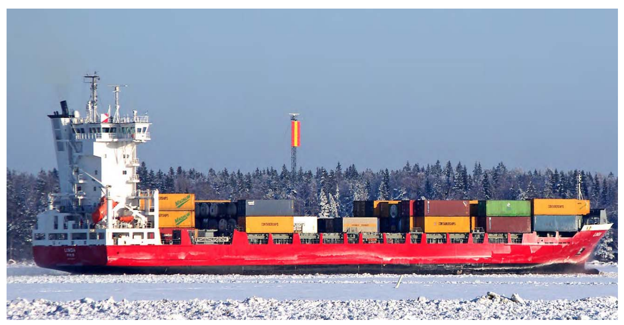
Figure 1. M/S LINDA

The investigation was finalised on 10 October 2012. The time used in the investigation report is Finnish time (UTC+2).