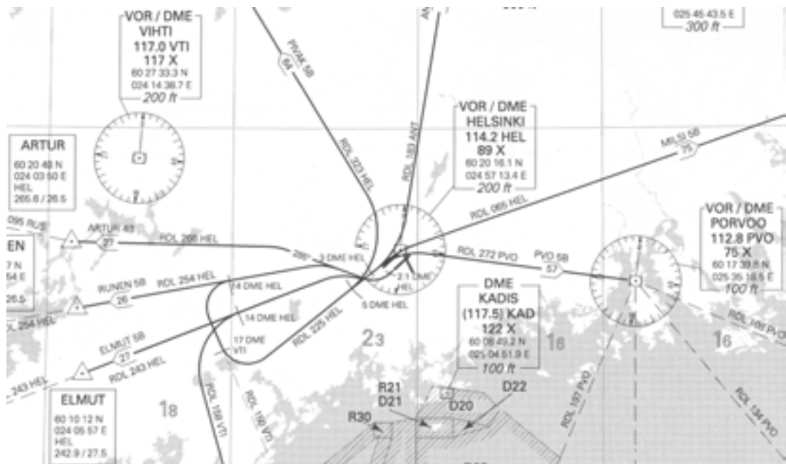
Figure 1. Standard Instrument Departures ARTUR 4B and PORVOO 5B

Climb to 4000 ft or assigned altitude if lower. Climb to higher level only when cleared by ATC. When passing 1500 ft contact Helsinki Radar.